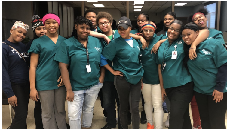
Photographed: Milwaukee GCD Students, 2018