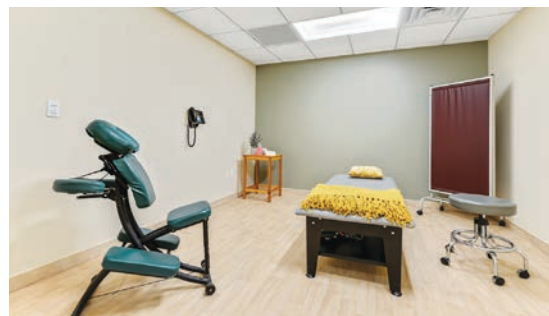
Rehab Suite, Library and Massage Therapy Room at our Bronx Adult Day Program