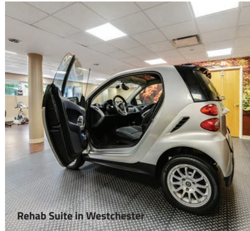
Rehab Suite in Westchester