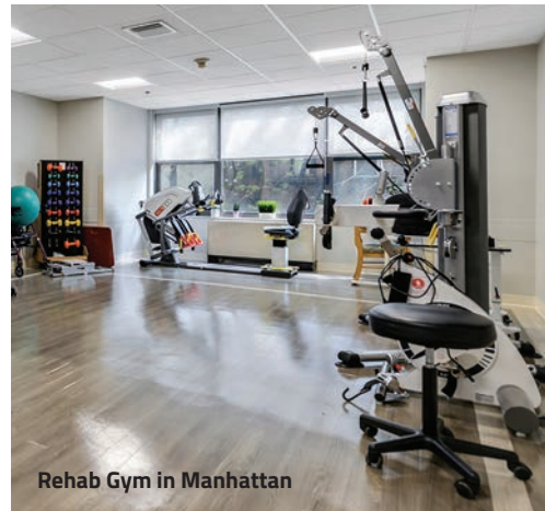
Rehab Gym in Manhattan