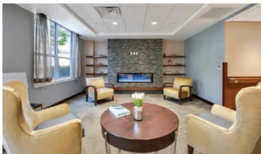
Small Houses on our Westchester campus