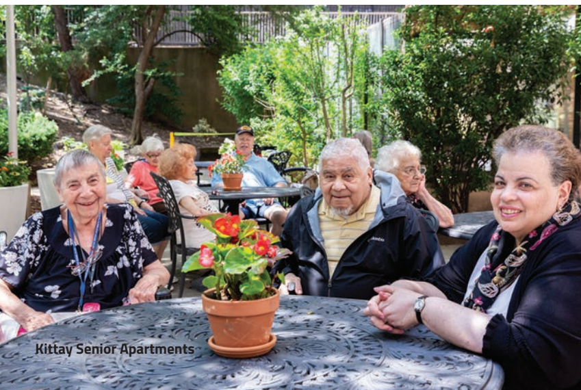
Kittay Senior Apartments

"I enjoyed the garden yesterday with my father. It's like an oasis in the middle of the city. I thought I was in the countryside."